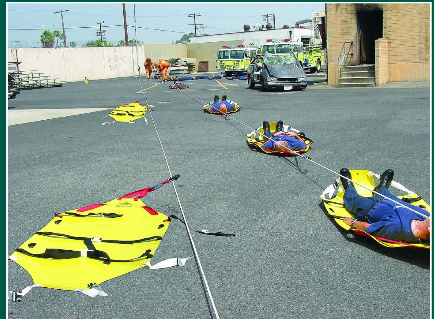
This is an illustration of a system utilizing the Skyhook winch with continuous loop rope, HMD Skeds and Haz-Mat rope grabs. As many as six victims can be dragged while sending empty stretchers back to the hot zone.

This litter is designed for use in mass casualty incidents where terrorists using Weapons of Mass destruction or any other Haz-Mat incident requiring level A protection may occur.